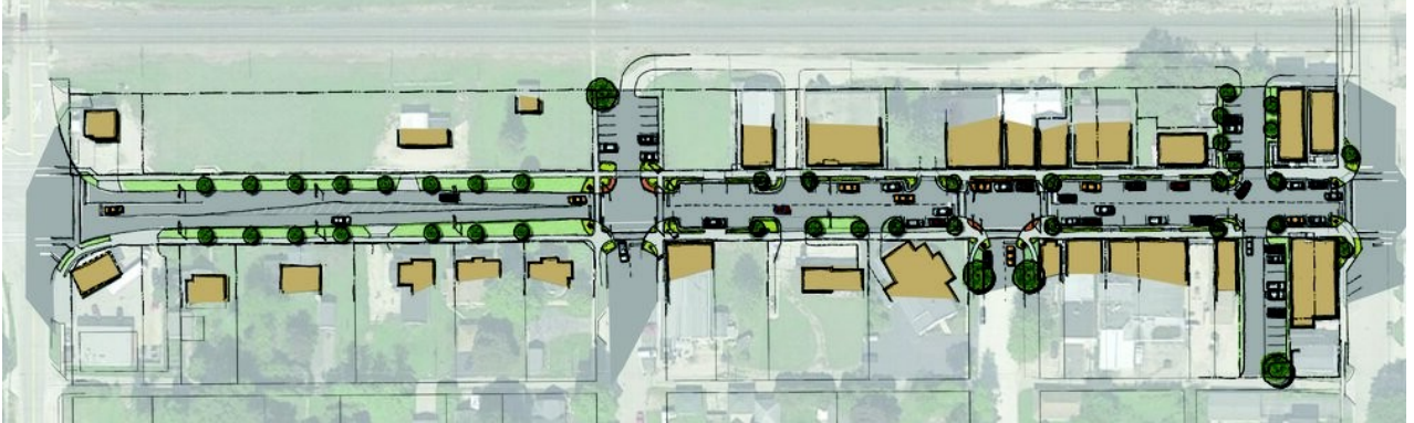
This is an artistic rendering, not the final layout

The Downtown Streetscape project aims to beautify and revitalize the downtown area by adding trees, landscaping, lighting, sidewalk bump-outs, and other features. The plan would also pave and change the configuration of the existing public parking lots.